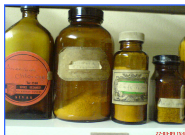
Picture 5. Various ingredients of magistral prescriptions

The factor which makes his pharmacy special is the production of wide variety of magistral prescriptions ranging from ophtalmic solutions to topical ointments (Pic. 5). Among those magistral prescriptions cough syrup for pediatric patients, acne lotions for adolescents, antiseptic solutions, pelade pomade, scabies pomade are the most demanded medicines.