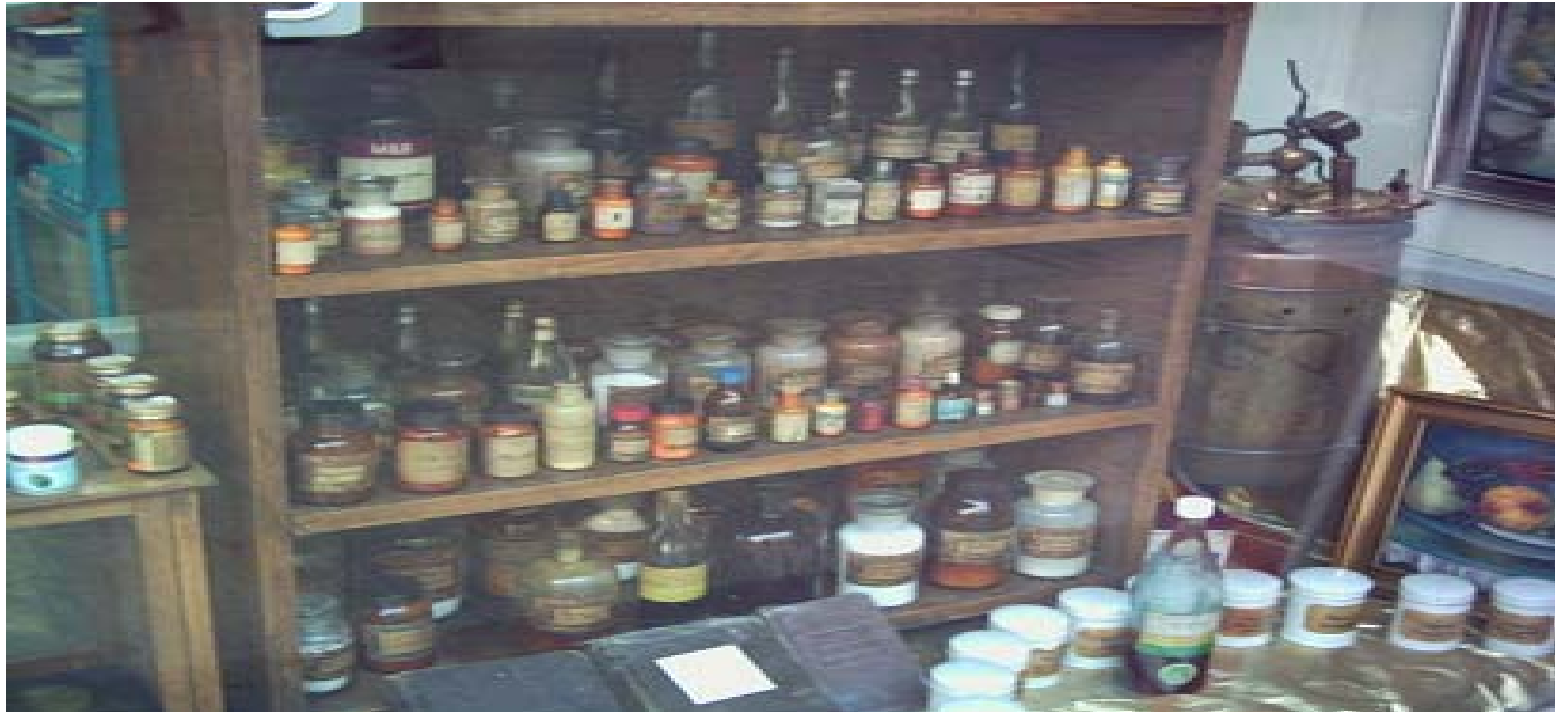
Ingredients used in magistral medicine making