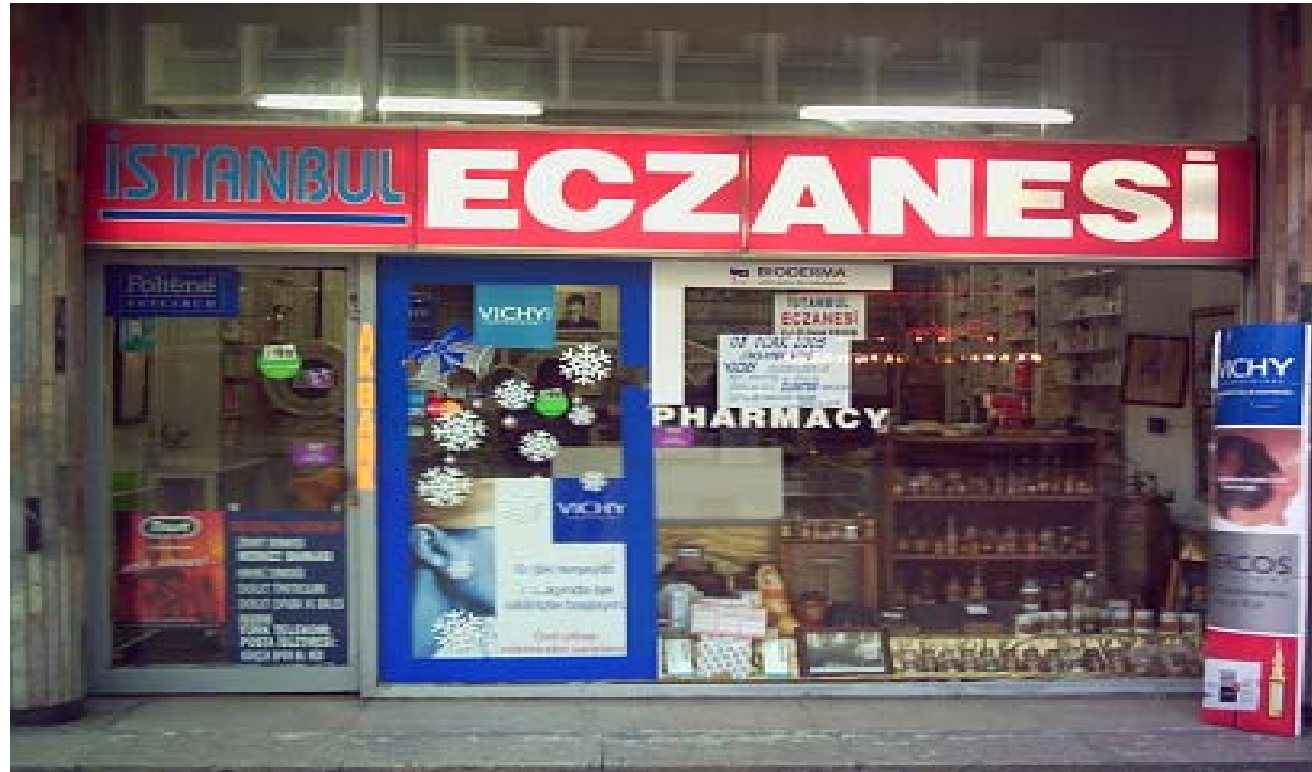
The view of Istanbul Pharmacy