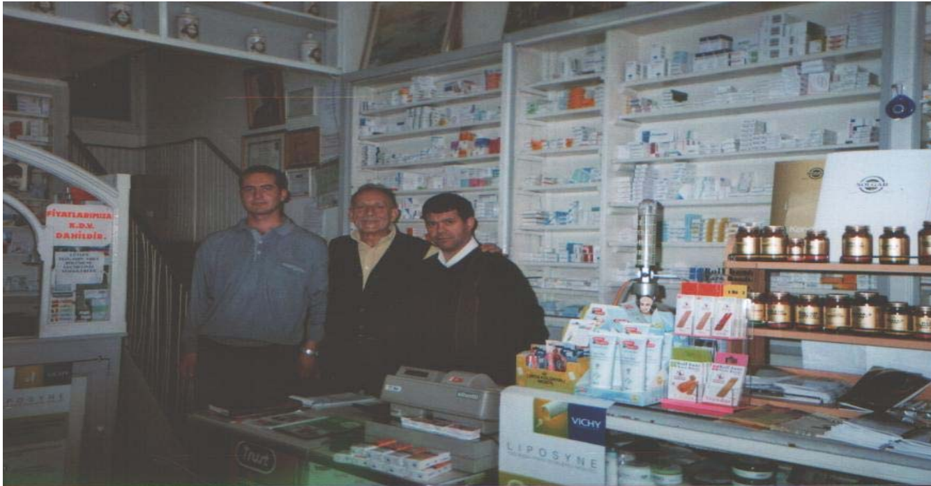
İstanbul Pharmacy Personell (Inside the pharmacy, downstairs)