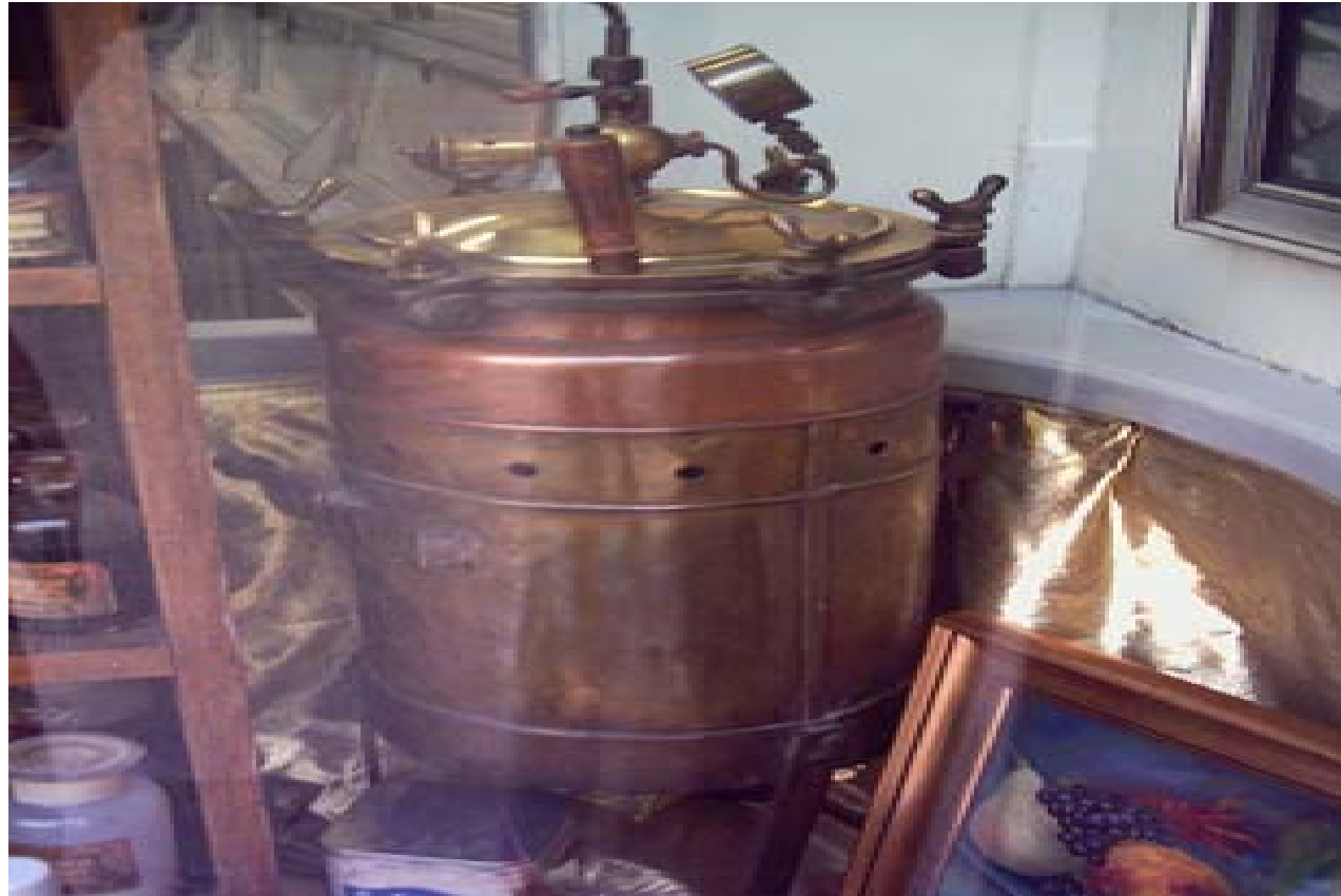
Autoclave used for ampoule sterilization