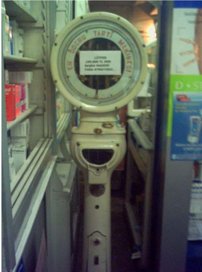
An antique weighing machine