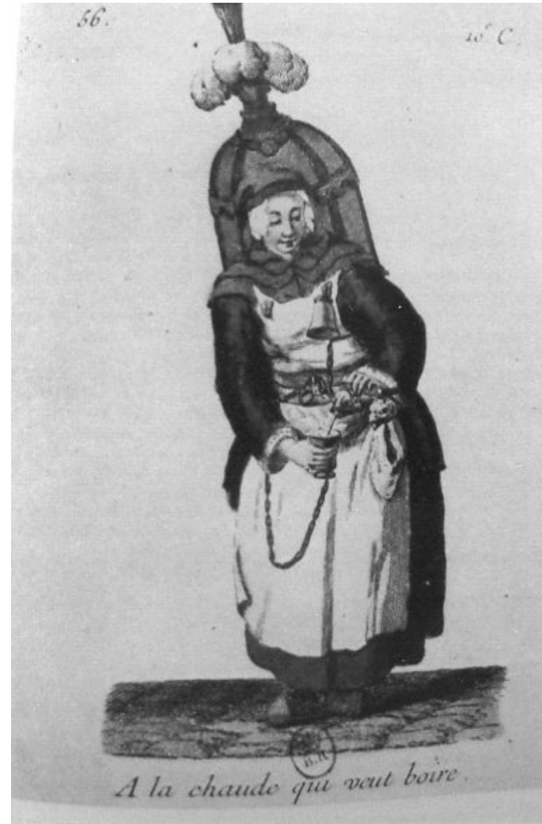
Herbal tea dealer