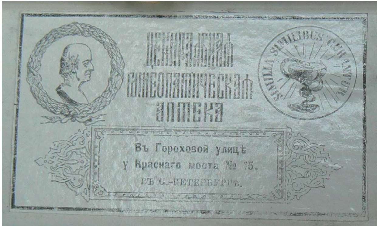
Russian homeopathy case Musée de la Pharmacie -Montpellier